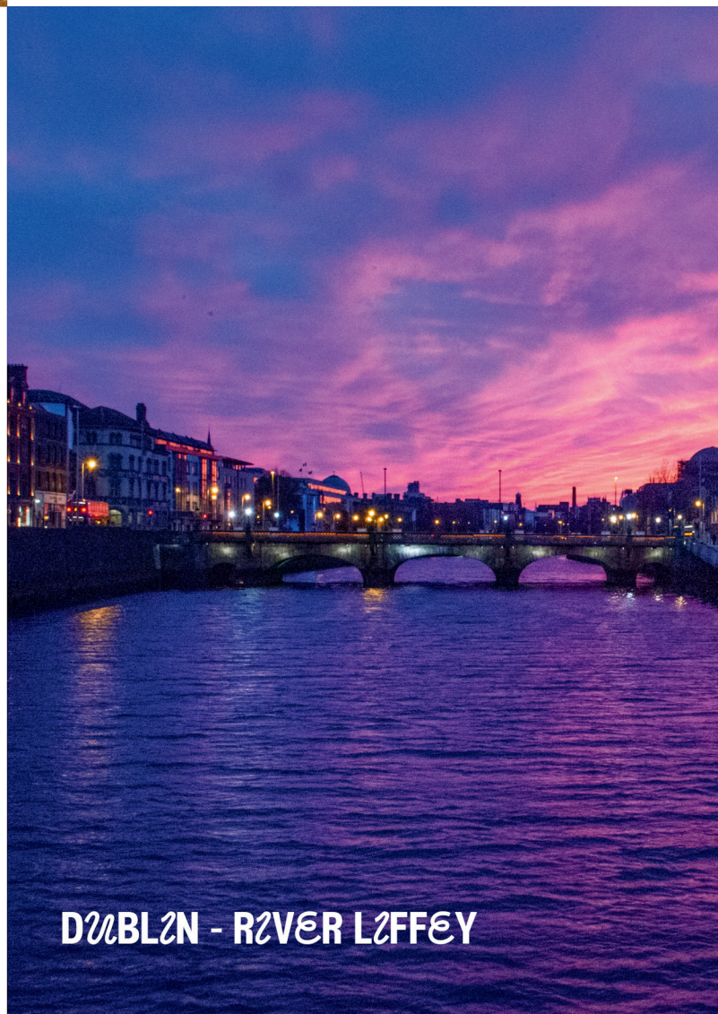
DUBLIN - RIVER LIFFEY

Take a ride on the Big Bus Dublin Night Tour and get a new overview of the city with a unique route and historical nighttime stories of Dublin's top sights.