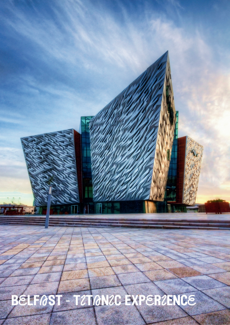
BELFAST - TITANIC EXPERIENCE