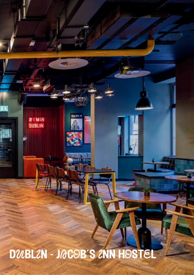
DUBLIN - JACOB'S INN HOSTEL